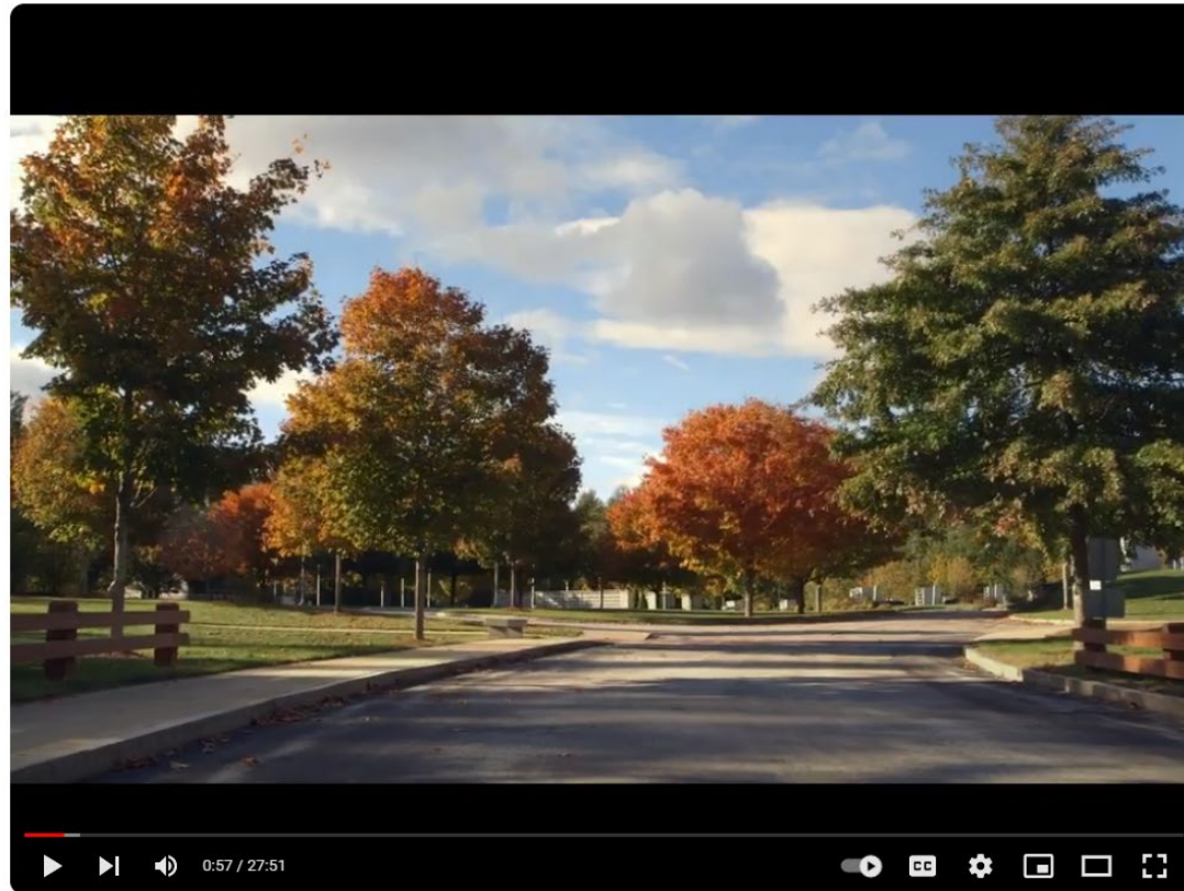
A Living Memorial - NH State Veterans Cemetery